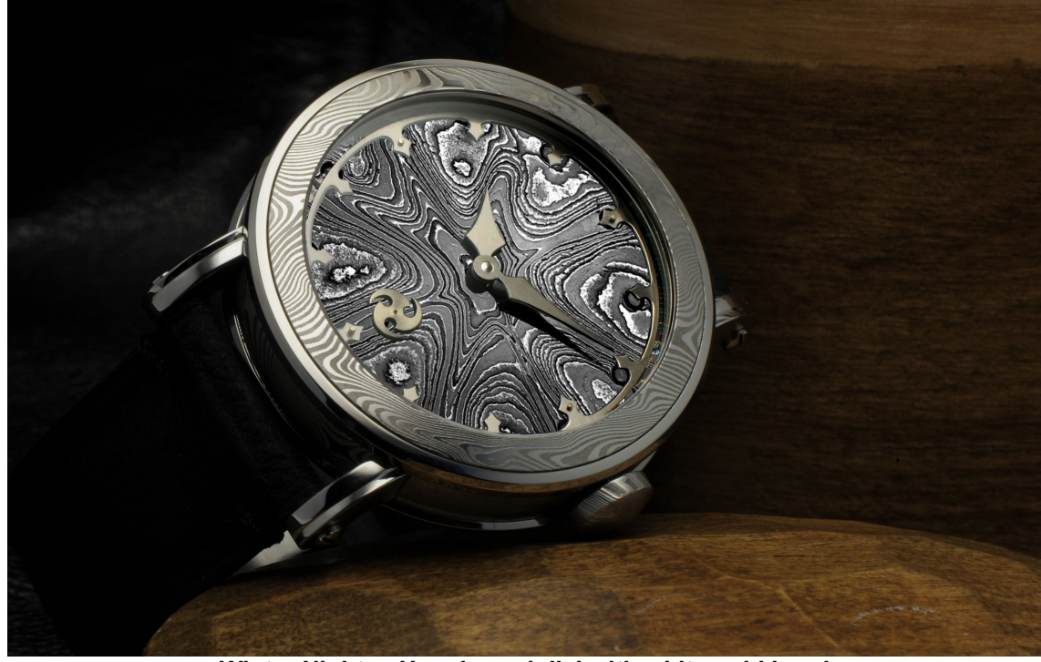
Winter Nights - Uncoloured dial with white gold hands

Customers can select a dial in natural steel or tempered coloured to a blue/purple nuance. Furthermore, the hands can be either white gold or yellow gold.