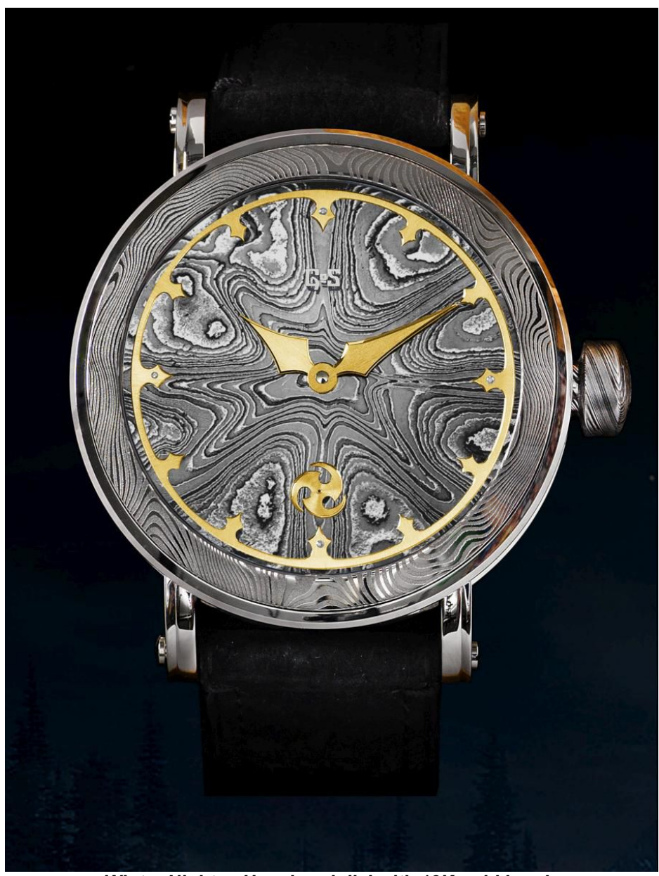
Winter Nights - Uncolored dial with 18K gold hands

GoS draws inspiration from Nordic nature and traditions and the Winter Nights is no exception - as it is connected to both sources of inspiration. During the cold and clear winter nights the chances of seeing the spectacular northern lights are the highest and the swirling patterns of the Winter Nights dial is reminiscent of the rapidly changing shapes of the northern lights.