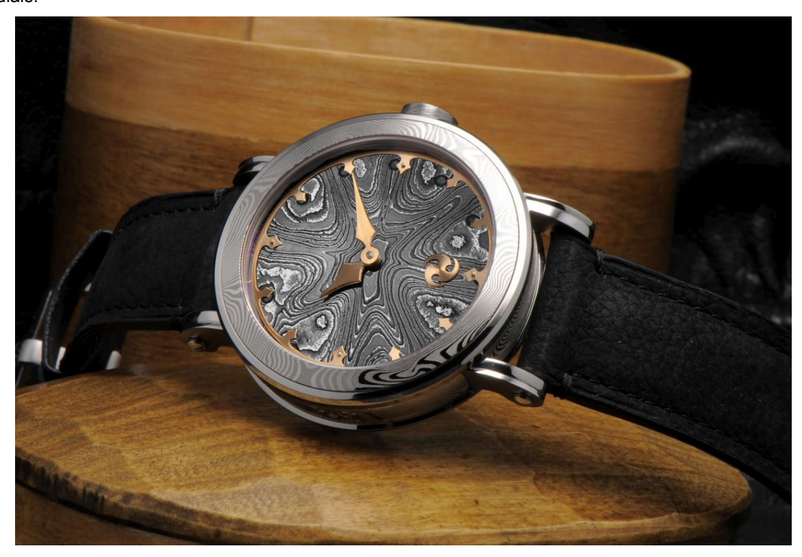
Winter Nights - Uncoloured dial with 18K gold hands