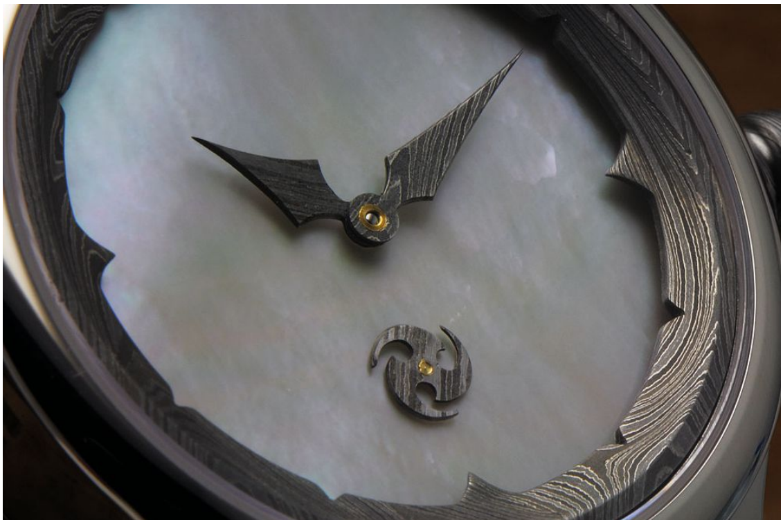
Damascus steel folder chapter ring and hands

Johan also mastered the more traditional layered damascus steel techniques, which he also experiment with. One example of this is the "Wildflower pattern" which is a development of the most famous damascus steel wood grain pattern. The traditional damascus steel and its organic look is what GoS has preferred in most watches. Making parts in this reduced scale requires different qualities from the steel. Using damascus steel on watch hands requires the pattern to be very sharp and rich of contrasts to be at all visible.